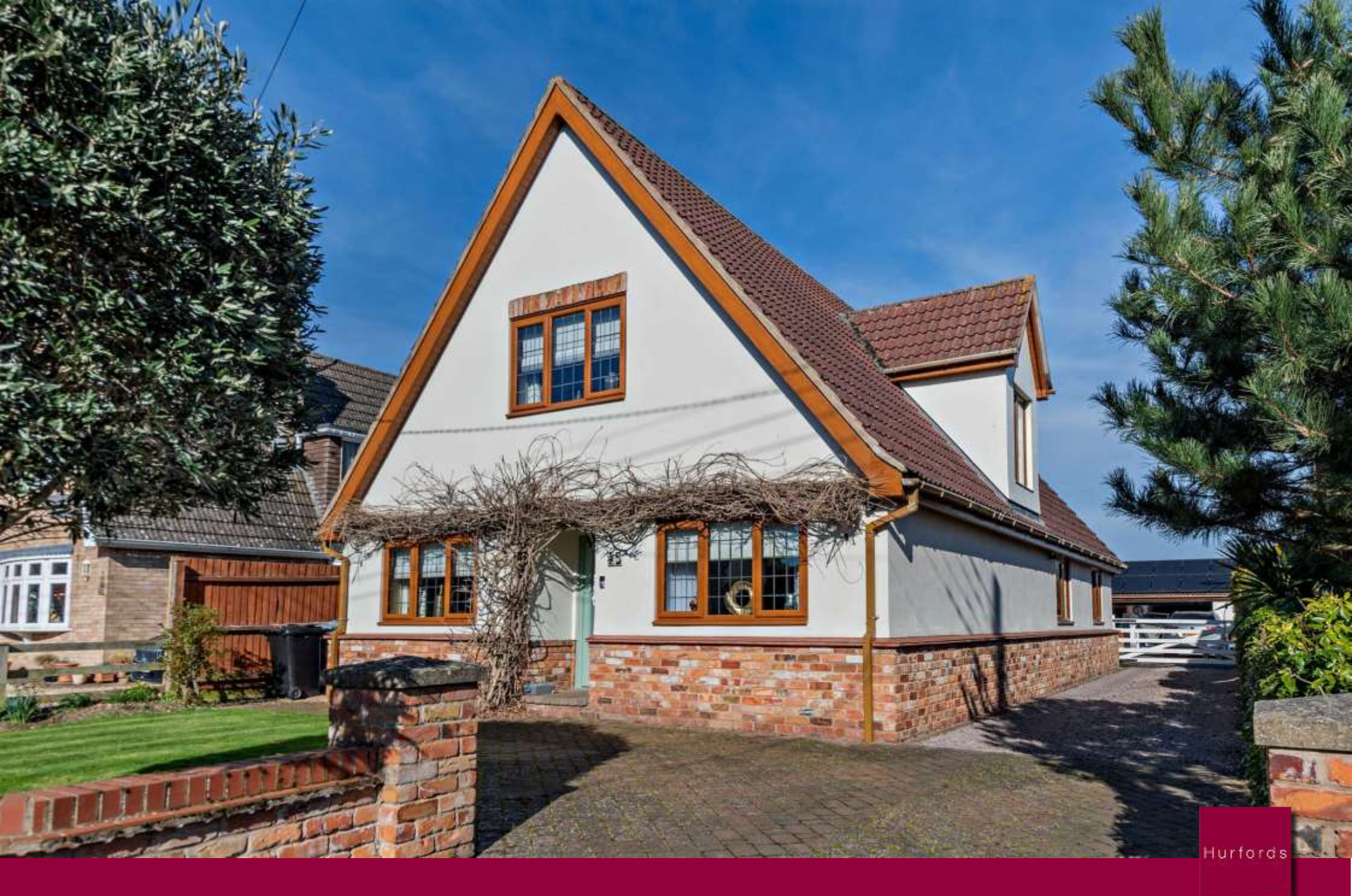
Frognall, Deeping St. James Peterborough Freehold: £575,000