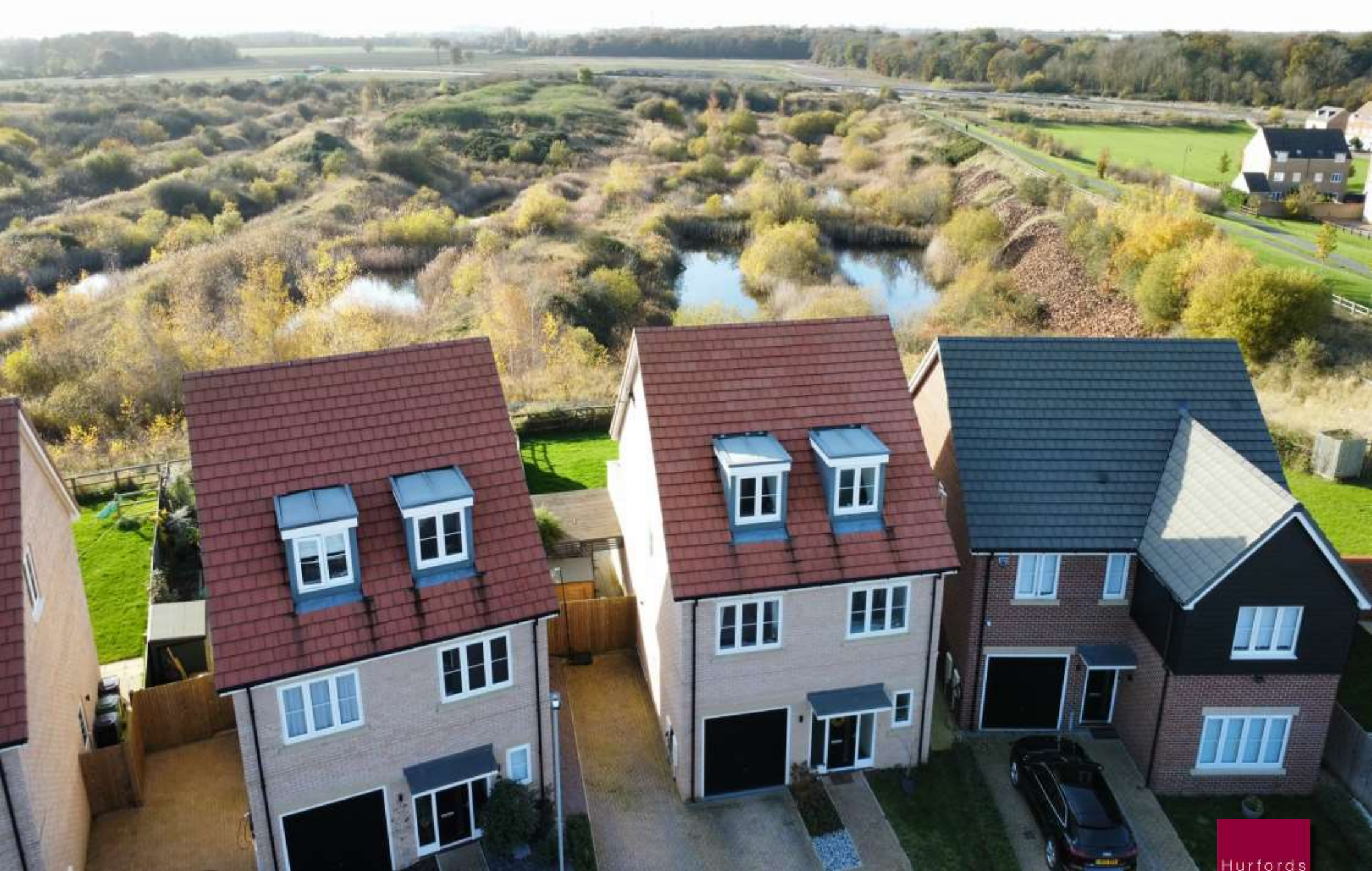
Hewitt Close, Hampton Heights Peterborough Freehold: £500,000